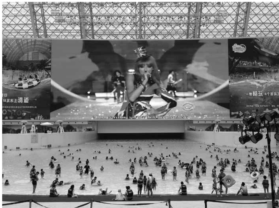
Figure 1. New Global Center, Taylor Swift, August 2016.

In the early 1990s, the traditionally discreet Chinese population suddenly became outspoken through “cultural” t-shirts (Wu, 2009). Printed Chinese characters featured messages such as: “Only my mom is best in this world”, “My future is not a dream”, and “A peaceful life for all good people”. Other t-shirts were more rebellious and conveyed messages such as, “I only follow my feelings” and “Getting rich is all there is.” As this fashion trend began to turn into a broader national trend, the government issued “emergency regulations” and formally banned the manufacture and sale of “unhealthy” cultural shirts in Beijing. The news promoted mottos such as “Study hard and make daily progress” and “I must train myself for the construction of the motherland” (Wu, 2009). In January 2018, China announced the ban of hip-hop culture and tattoos from all media sources (Pasha-Robinson, 2018). Gao Changli, the publicity department director at the State Administration of Press, Publication, Radio, Film and Television of the People’s Republic of China promoted regulations such as “Absolutely do not use actors who are tasteless, vulgar and obscene. Absolutely do not use actors whose ideological level is low and have no class. Absolutely do not use actors with stains, scandals and problematic moral integrity” (as cited in Pasha-Robinson, 2018).