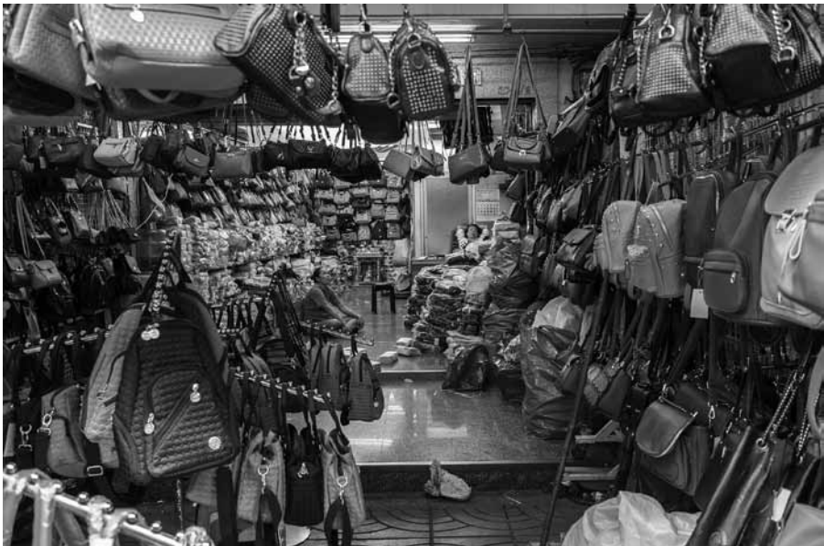
Figure 4. Boredom. Guangzhou, China July 2017.

Today, hundreds of giant hyper-malls all over China are connected to the distribution of fake “stuff.” These commercial emblems have become an integral part of China’s visual and social landscape. The quantities of fake goods using Western brand images (e.g. logos, symbols, and language) has grown for centuries to become an abstract superstructure of falsely branded lifestyles and design integrity. For example, in a Beijing mall where all garments are sold for less than $50 USD each, the decor consists of crystal chandeliers, shiny marble, and mirrors; these overt indications of luxury are important to social status –and shoppers. The aesthetic of the store’s environment is of high interest in the context of this research because it lends a form of prestige and exclusivity to the fake goods.