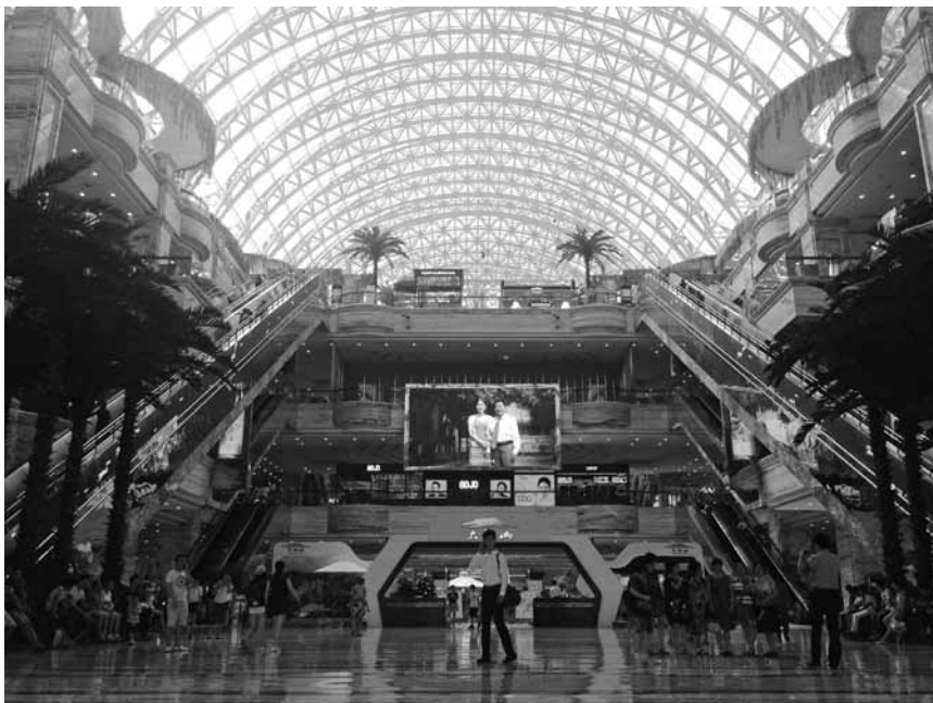
Figure 2. New Century Global Center, Luxury Mall Interior. Chengdu 2016.

In Asia, the concept of "luxury" is still mostly embedded in objects or goods. Banta's (2017) research found that "throughout early historic periods, the Chinese have shown their conspicuous display of wealth and power through material objects. Most notably through the use of gold, ornate jade, and gilded objects" (n.p.). Today, luxury goods are conspicuously displayed at social gatherings, business meetings, and even a date. To the Chinese, luxury still revolves around identity and status symbols.