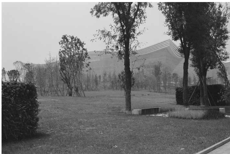
Figure 3. New Century Global Center, Exterior Landscape, Chengdu, August 2016.

China continues to invest in bigger, grander environments for consumption. Some of the largest buildings in the world are located in China. Chinese investors spend tremendous sums of money on erecting giant retail complexes for shopping and entertainment. For example, The New Century Global Center, developed by billionaire Deng Hong's Entertainment and Travel Group based in Chengdu, was created to be less about material consumption and more about experiences. The Center is a place to meet friends, go to video arcades, see a movie, eat, swim, skate, and sing karaoke. The giant space also offers offices, conference rooms, a university complex, two commercial centers, hotels, an IMAX cinema, a Mediterranean-styled "Village", a pirate ship, a church, and a skating rink. The Center's premier feature is a water park named "Paradise Island Water Park" that contains a 5,000 m 2 (54,000 square feet) artificial beach where a giant 150 by 40 m (490 by 130 ft) screen forms an artificial horizon to replicate sunrises and sunsets. At night, a stage extends out over the pool for concerts. The New Century Global Center is ranked as the number-one building with the largest floor area in the world, containing 1,760, 000 m 2 (18,900,000 square feet) of floor space, followed by Dubai International Airport's Terminal Three.